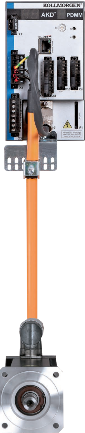
The powerful AKD PDMM servo drive with integrated motion control and an AKM servo motor. Just one example of the flexibility of Kollmorgen's modular single-cable system.